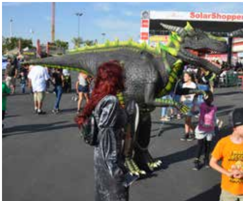
Dragons were seen roaming the Fair Grounds