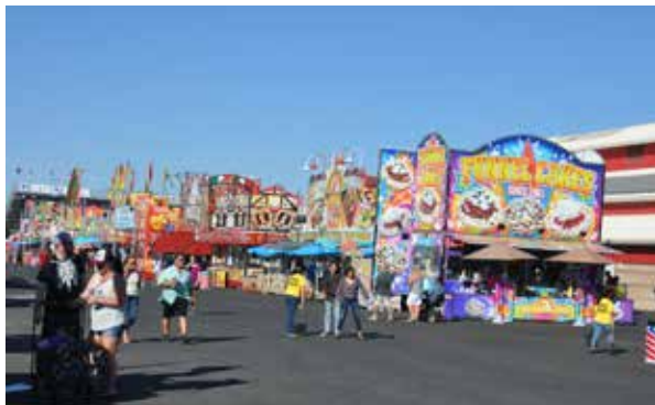
Midway at the Fair - Fair Food for all