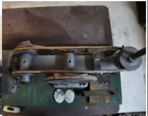
Antique Automatic Drill Press Drills Holes in Rocks at the Fair